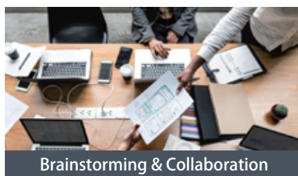
Brainstorming & Collaboration